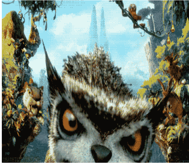
4.1.3 Low angled shot