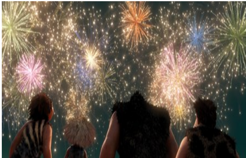
4.1.4 Under head shot