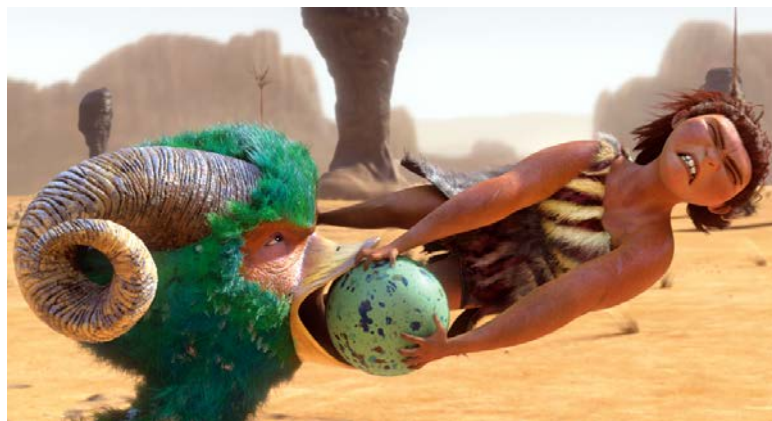
4.1.5 Eye-level shot